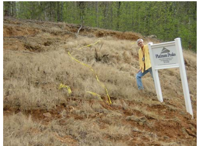
Figure 20. Small landslides on Platinum Peaks development along road leading to Bradford house.