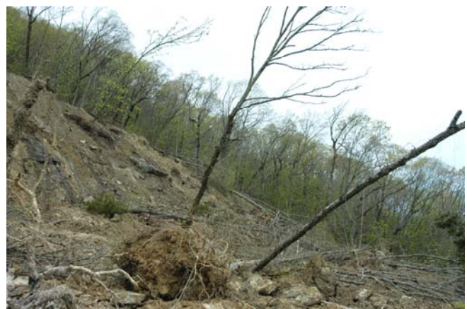
Figure 6 (above). Translational slumping. Figure 7 (below). Lower portion of slide area.