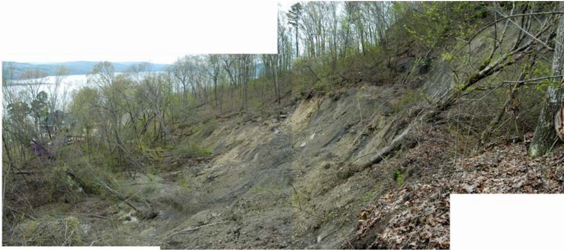
Figure 4. A view looking east north east at the upper portion of the slide area.