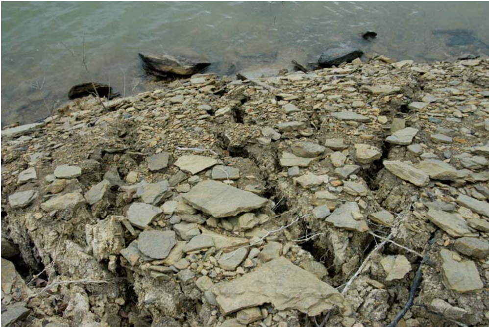
Figure 8. A pressure ridge extending into Greers Ferry Lake.

The small toe thrusts, noted in the lower reaches of each portion of the slide as lobes of debris, overran one another and stacked en echelon. These lobes were better developed on the lower portion of the slide near and in the lake. Some portions of the hillside apparently failed and were displaced somewhat intact. Groups of trees were transported laterally or slightly downslope with little disruption. Both rotational and translational slumping were noted on the west side of the 600-foot contour sandstone interval. However, most of the slide's failure seemed to be via debris flow and rafting