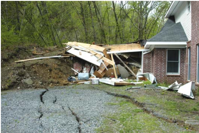
Figure 1. Bradford garage.

Early on the morning of March 28, 2005, after two days of rain, a significant landslide occurred on the north side of Stevens Point on the south shore of Greers Ferry Lake. The slide collided, in part, with a house owned by Shirley Bradford, crushing the garage (Figure 1) on the south side of the house and tearing a small room off the west side (Figure 2). The slide ultimately involved an area extending from a sandstone ledge over one hundred feet in elevation above the house down to and into the lake over one hundred feet in elevation below the house and extending to either side of the house.