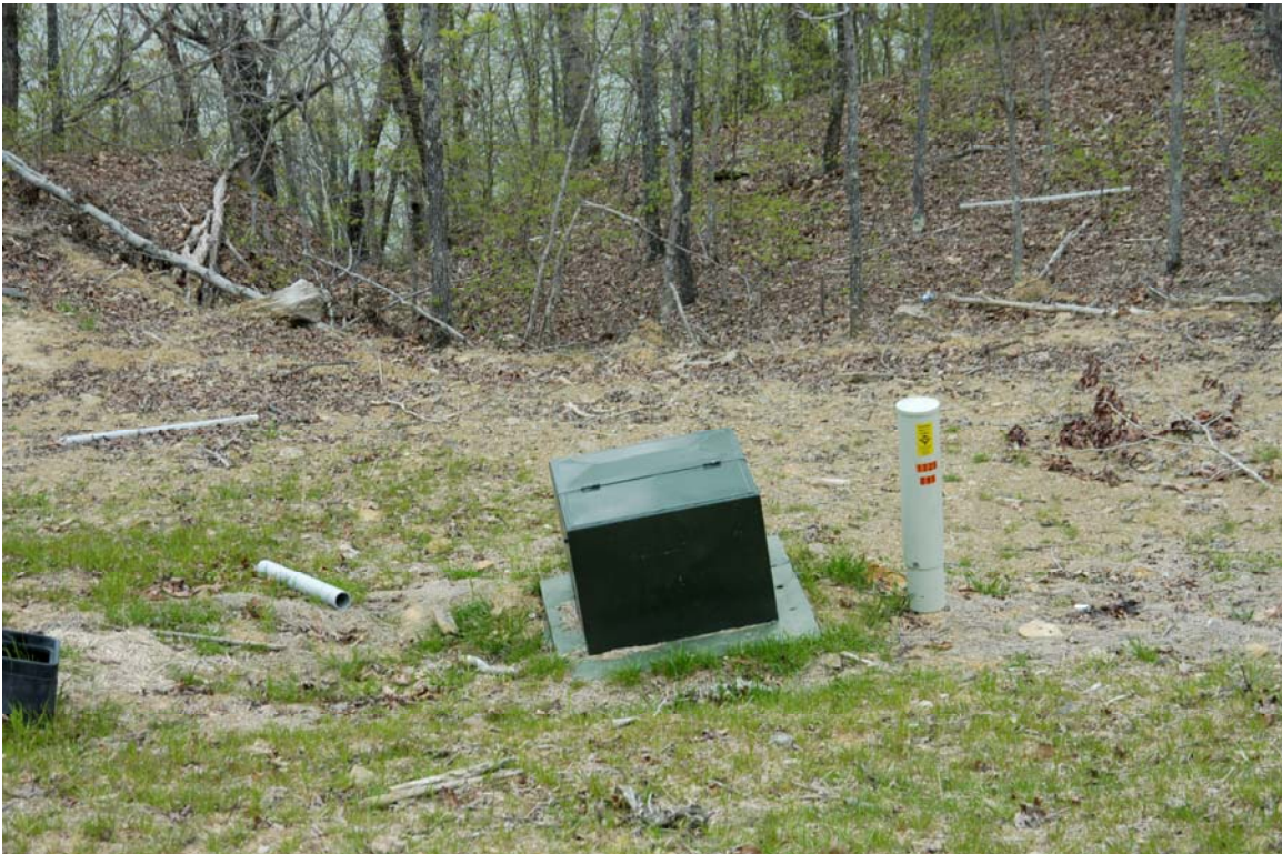
Figure 19. Phone and power boxes displaying effects of subsidence and displacement marginal to main slide area.