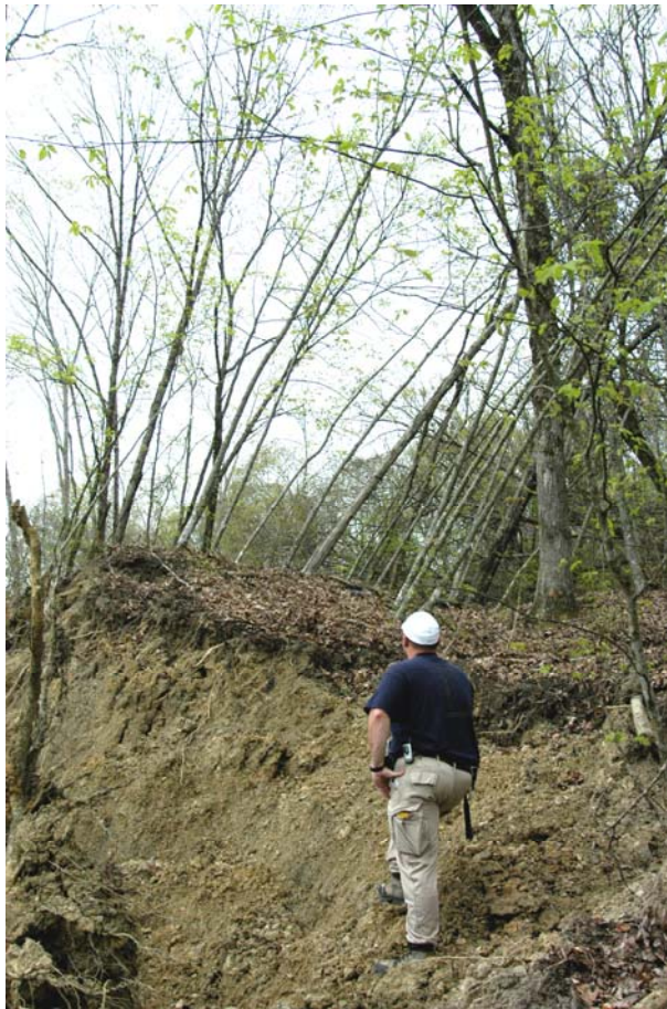
Figure 5. Rotational Slumping.