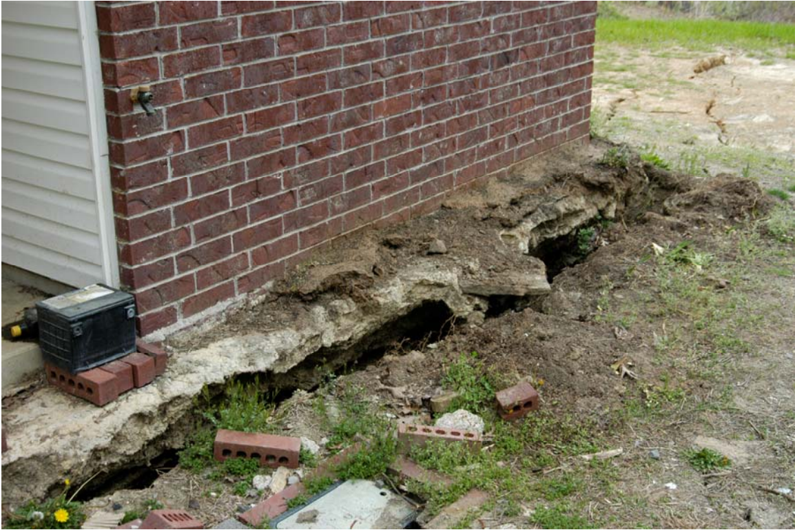
Figure 18. Surface subsidence on the east side of the Bradford house revealing its foundation.