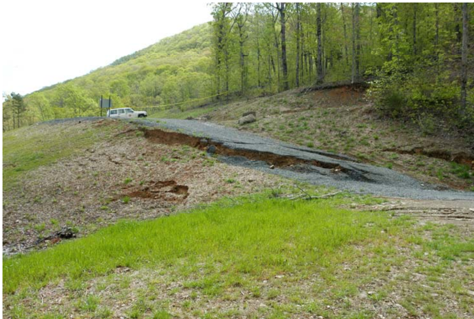
Figure 13. Ground displacement and subsidence east of the Bradford house.