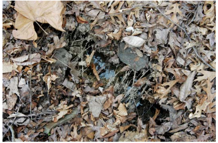
Figure 12. Incipient ground cracking due to minor slippage marginal to main slide. Note water in crack.