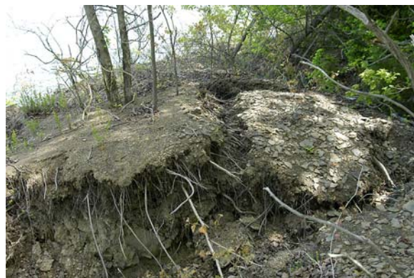
Figure 10 (above). Pressure ridge formed at lakeside.