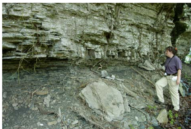
Figure 17. Poison ivy killed by root separation.