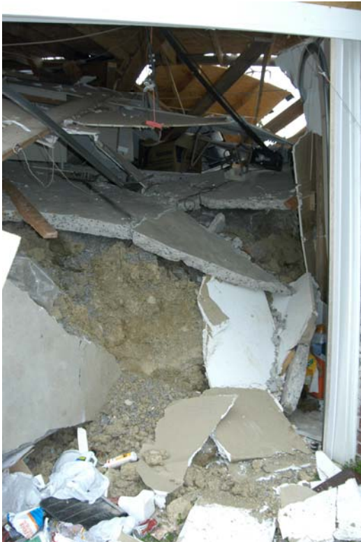
Figure 9 (left). A pressure ridge developed beneath the garage floor of the Bradford house.