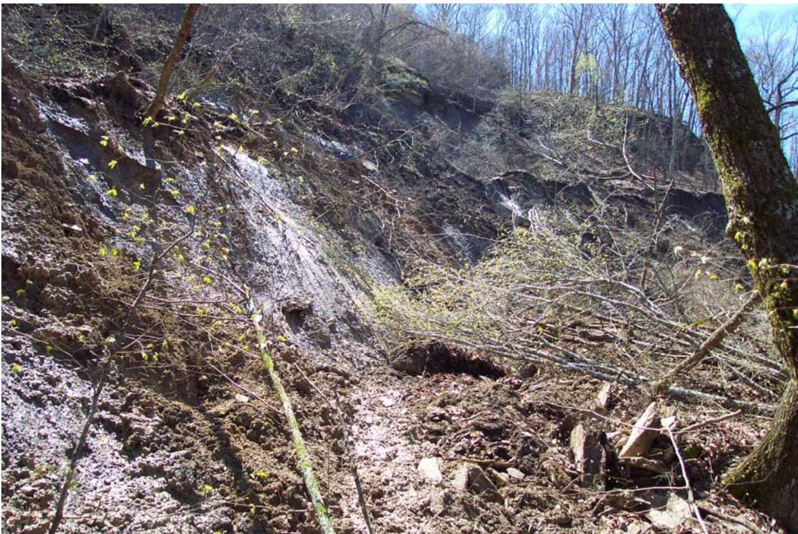
Figure 14. Crown scarp March 28, 2005. Note water flowing freely over scarp surface.

The March 28 events were preceded by two days of rain. On the day of the slide water was still running off the slope in several streams. Two of these streams formed small waterfalls over the main crown scarp (see figure 14). This water was mostly absorbed by the upper slide mass and did not result in overland flow much below the upper slide area. However, water was copiously seeping from the lower developing scarp formed by the 600-foot ledge. A week later the 600-foot contour ledge had more fully developed into a secondary crown scarp which displayed persistent flow from a joint in the sandstones several feet below the overlying surface. Observations around the slide area suggested that upslope runoff water was focused into this portion of the hillside. Open joints on the sandstone and siltstone outcroppings offered conduits for direct injection of water to the regolith/bedrock interface, promoting lubrication and instability.