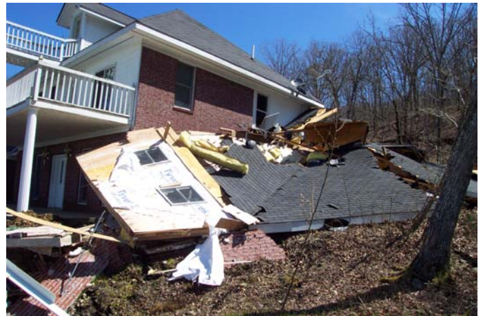
Figure 2. West side of Bradford house.

The bedrock sequence on the hillside seems to be in the lower Atoka Formation. It consists of a thick sequence of shale interrupted by thinner intervals of siltstones and sandstones. The slope is compound and in profile somewhat typical slope and bench. Two significant sandstone intervals were noted on the slope, one just below the 600-foot contour and the other near the 720-foot contour. These resistant units produce ledges that crop out incipiently. The sandstone ledges exhibit fairly frequent joint sets trending subparallel to the slope face and into the slope face at about north 10 to 20 degrees west. The hillside is draped with a thin to thick soil of residuum and colluvium derived from the weathered bedrock and is covered by a mature forest, except where disturbed by fairly recent cultural modifications. The slope averages about 20 degrees in the vicinity of the slide, but varies locally from near vertical to nearly level.