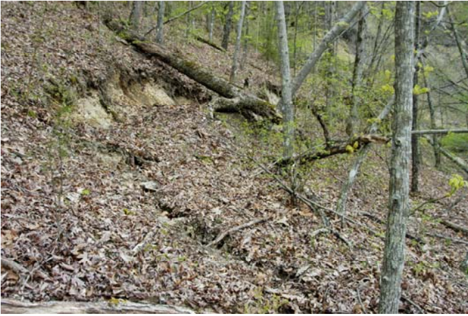
Figure 11. Slippage marginal to main slide.

Displacements and cracked ground were noted adjacent to the main area of failure (Figures 11-13). These slide margin displacements tended to be shallow slips of just a few feet. Often their expression is presented via a low crown scarp dying out with distance from the main slide area. The toes of these marginal displacements are somewhat indeterminate due to the natural roughness of the slope and a thick forest-litter cover. These marginal slides extended up to a few tens of feet, reaching over a hundred feet in at least two cases, from the main slide track.