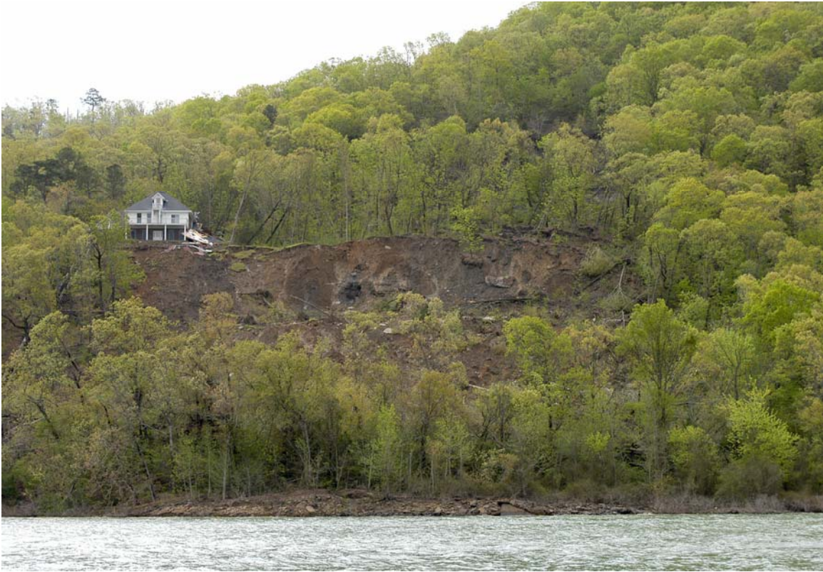
Figure 3. Slide area from Greers Ferry Lake. The upper portion of the slide is partially hidden by foliage still standing on the 600-foot contour ledge.

also has some incipient marginal displacements extending laterally from the main slide area. The main crown scarp is developed just below the 720-foot contour sandstone ledge and the lowest toe development is in the lake. At the time of the slide the lake level as reported by the Corps of Engineers was 463 feet above mean sea level. Both the upper and lower portions of the slide are similar in that they have a steep upper section and flatten out to near level in their lower section. The upper sections have completely failed and display near vertical scarps in places. The lower sections are a jumble of trees, soil, rock, and other debris displaced and fallen from above. Pressure ridges are common along the toes of each section, forming from subsurface flow of the soils and small lobe thrusts. Rock falls, mud/debris flows, and translational and rotational slumping are all evident in various places in the slide area (Figures 3-10).