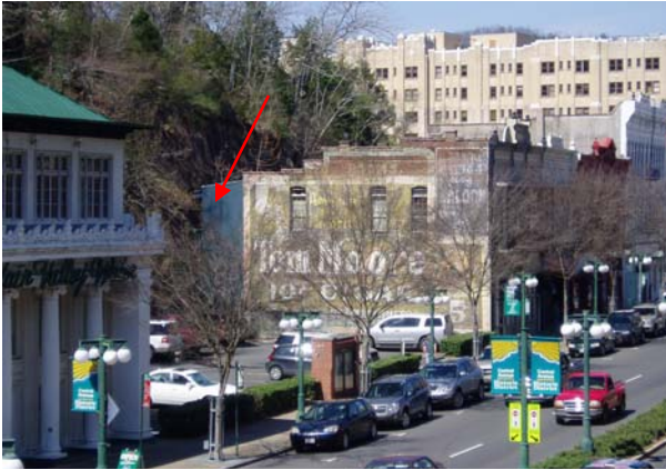
Looking across Central Avenue to the former Hot Springy Dingy Shop in 2008.

On Saturday November, 11, 1995 at about 2:30 PM, a landslide occurred behind a group of buildings located in the 100 block of Central Avenue. The slide burst through the rear wall of two buildings and part of a third, killing one person and injuring two other people inside the Hot Springy Dingy novelty shop. The landslide appeared to be a rock slide from a near vertical highwall exposure. The failed mass was estimated to have been 43 feet long, 30 feet high and about 2 to 3 feet thick (McFarland and Stone, 1995). These dimensions suggest that over 200 tons of rock were involved in the slide. A large amount of brick from the back wall of the buildings fell on the slide debris. A minor amount of other