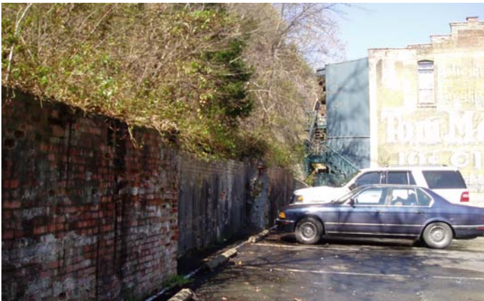
The parking lot adjacent to the Hot Springy Dingy Landslide site. Notice the green building extension, which was destroyed in 1995 after the rock slide, but has since been repaired.

cultural objects from the slope above added many more tons of material to the talus accumulation. Those who witnessed the landslide recalled hearing what sounded like a bomb detonating inside the shop. Reporters described the scene as being "somewhat macabre." Onlookers came to take pictures of the site, and several Halloween-themed, plastic foam tombstones were placed on the sidewalk outside the novelty shop. One read "Will E Makeit" (Wolfe, 1995). The Hot Spring Dingy Landslide remains yet another tragic reminder of the hazards faced by this city.