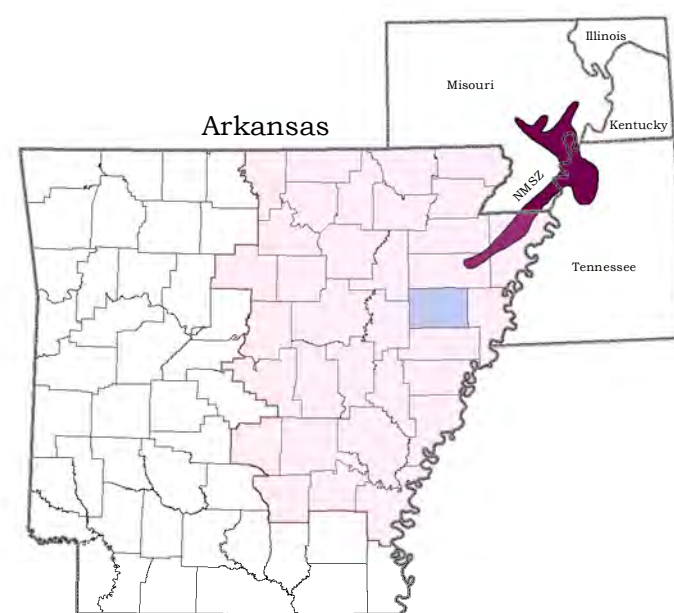
Cross County (shaded in blue) is located inside the New Madrid seismic zone catastrophic planning area (shaded in pink), as designated by the Arkansas Department of Emergency Management (ADEM). The New Madrid seismic zone (NMZS) is shaded in purple.