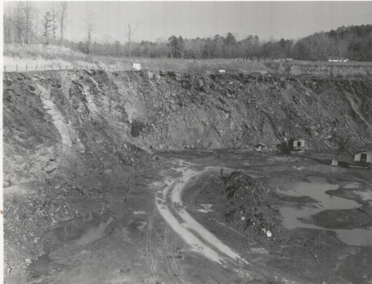
Mac. Feb. '73, Ms and faults, Bird and Son pit